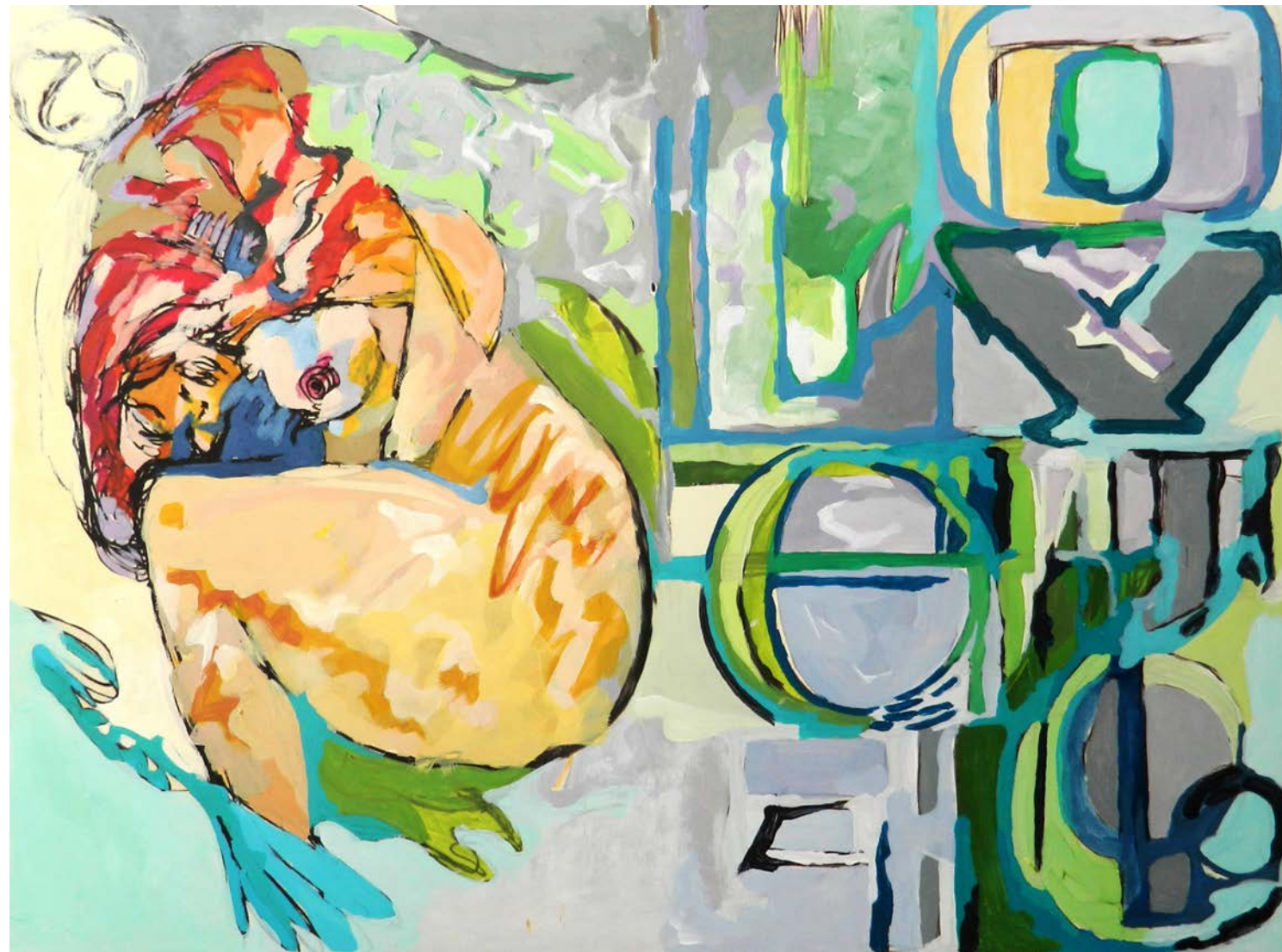
Twenty-five Acrílico on paper. 60 x 85 cm

Carrera del Darro 13, Granada, 18.010 Granada, Spain + 34 958 2150 40, www.ladrondeagua.com Open from the 28 of March, each day, from 4pm to 10 pm