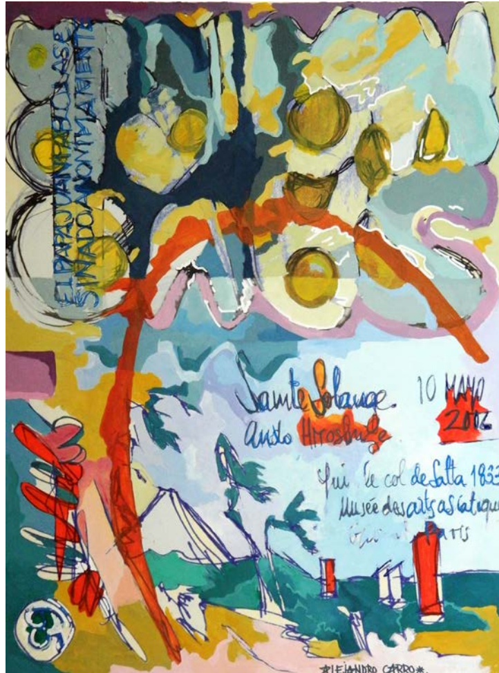
Savonarola Acrylic on paper. 85 x 60 cm