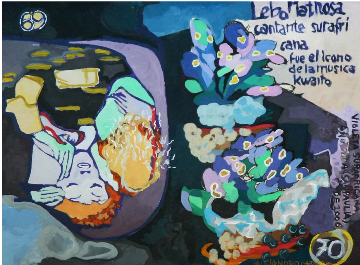
Violets Acrylic on paper. 60 x 85 cm